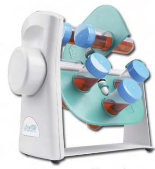
Revolver with H5600-50 Rotisserie