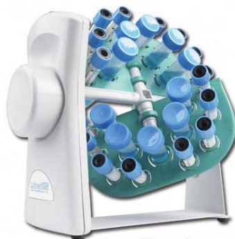
Revolver with H5600-15 Rotisserie