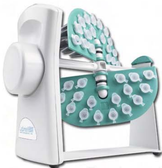
Revolver with Standard Rotisserie

With a molded housing and unique rotisserie design, the Revolver is easy to clean and decontaminate. A 36 x 1.5/2.0 ml rotisserie is supplied with the Revolver. Other configurations are available separately.